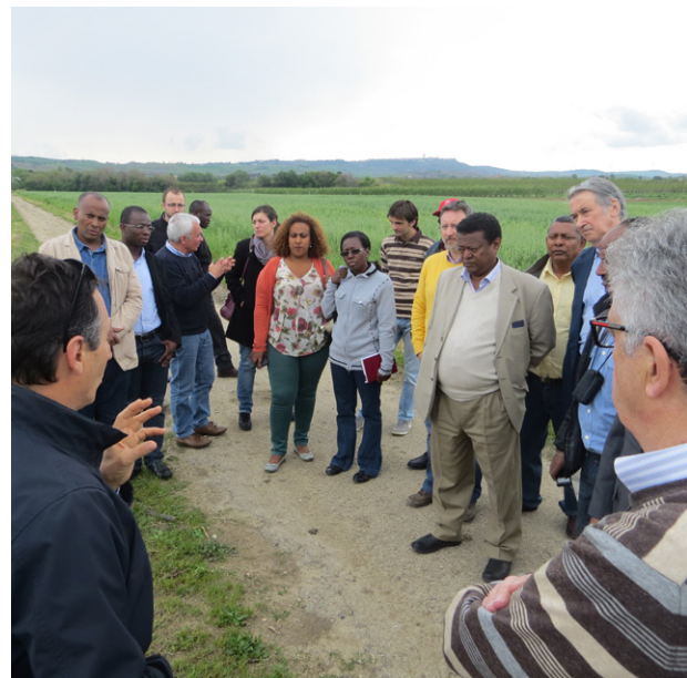
Visit of ACP staff members to an Italian organic farm in April, 2014