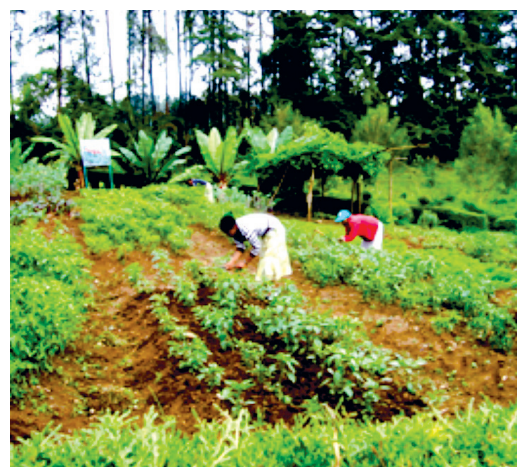
View of a biofarm promoted by BEA in Addis Ababa (Ethiopia)

Model farm facilities (BIOFARM) are integrated elements of the Biofarming approach and serve for demonstration, training and research purposes. BS is introduced to farmers through short intensive periods of training, based on an analysis of local agro-ecological constraints and different types of sustainable natural resource management practices introduced into farming systems. The establishment of BS is of particular interest in areas where resources are scarce. Diversification of production activities are required that ensure positive impacts on the ecosystem. HEIs should play a fundamental role in introducing innovative technologies, however partner HEIs still face relevant challenges: qualified academic staff shortage, limited capacity to provide postgraduate courses, limited chances to share experiences internationally, insufficient resources to train skilled experts and limited from reduced research and innovation capacities.